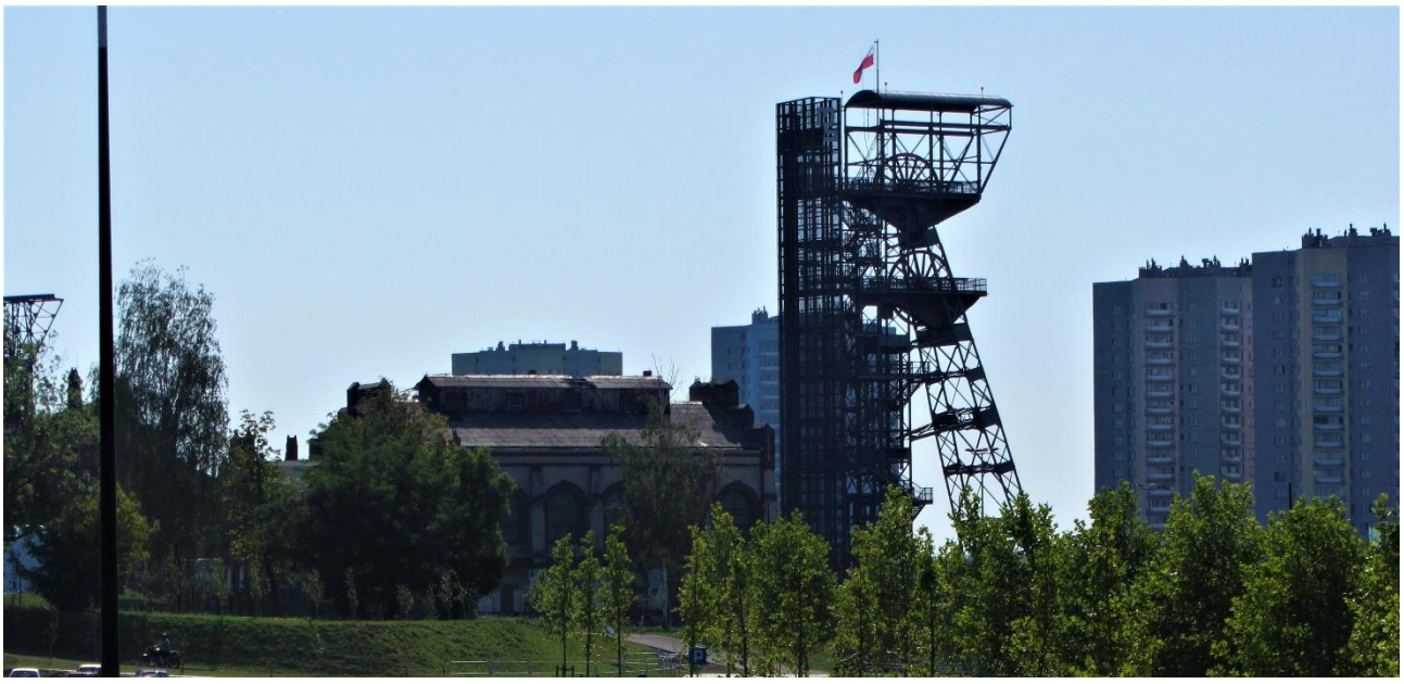
Coal mine in Katowice, Poland

The use of masks is vital for reducing worker exposure to coal dust. In theory, they should work well for most types of dust, including PM_{2.5} . Their performance in the workplace, however, is generally much poorer than suggested by manufacturers' literature. This is because their effectiveness depends on whether they are fitted and worn correctly which can be compromised if the worker adjusts the mask to make it more comfortable, to fit around other equipment such as glasses, or does not replace their mask or mask filter regularly. Another important aspect is that workers may sometimes only wear their masks when they visually or otherwise sense high dust concentrations, which will be mainly due to the presence of relatively coarse particles, and less so when there are imperceptibly high levels of PM_{2.5} . These issues will be tackled through quantitative performance testing and ranking of currently available RPE from different manufacturers using laboratory-based stand tests and workplace experiments.