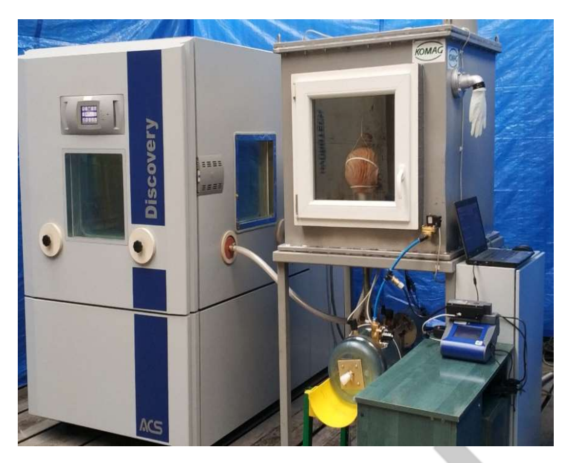
KOMAG's test stand for half masks

As a result of the ROCD project, KOMAG has designed and built a test stand to assess the quality of half-masks used in Polish and Slovenian mines. From this they have created a database to compare the attributes of half-masks and their filters. The test stand is equipped with a dust chamber, an artificial human head, artificial lungs and a climate chamber in which air to be exhaled is humidified.