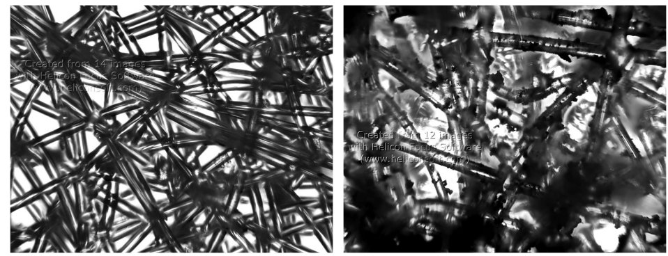
View of the first layer of an unused (on the left) and used half mask (on the right)

The filter of the FFP3 masks usually consists of 3 layers. The first layer consists of synthetic fibres, with a thickness of 10-20 \mu m, which act as a primary barrier to the largest particles. The middle layer, which is the most important, is made of densely pressed thin fibres which have a thickness of 2-3 \mu m. The third layer, which is usually similar to the first, provides inner protection for the middle layer.